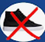
High top shoes