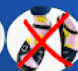
Socks & sandals