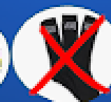
Socks with branding