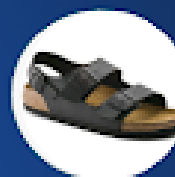
Black "Birkenstock" style sandals with backstrap