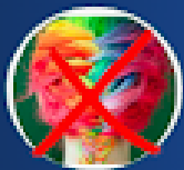
Unnatural Hair Colour