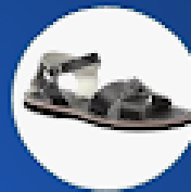
Plain Black Sandal with back strap