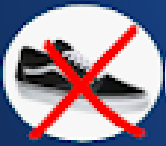
White/coloured details on shoes