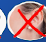
Large Studs, Pearls or Diamantes