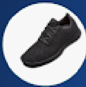
Plain Black Shoes